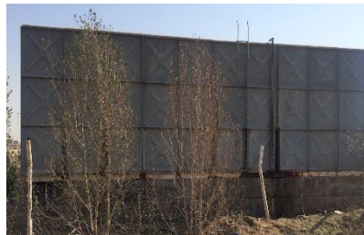
Main water tank inside the campus